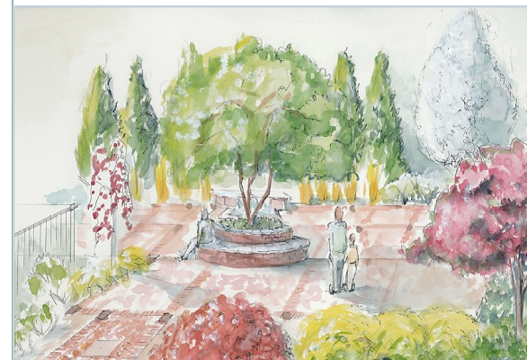
Garden located at 825 White Spruce Blvd., Rochester, NY 14623

"We who choose to surround ourselves with lives even more temporary than our own, live within a fragile circle...Unable to accept it's awful gaps, we would still live no other way"